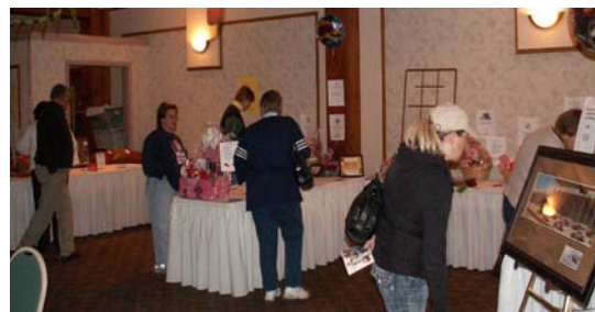
Everyone enjoyed the Silent Auction.