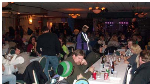
As you can see there was a great turnout!